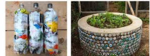
Reducing Plastic in the World through Eco Bricks

Create eco-bricks by filling plastic bottles with soft plastics. Think creatively about how you might join the bricks together to make a structure. What will you make?