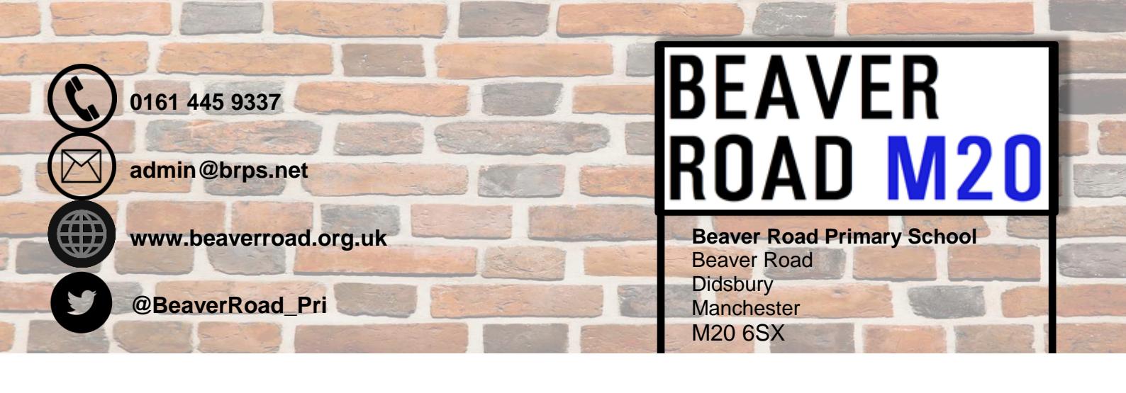
Friday 18th February 2022